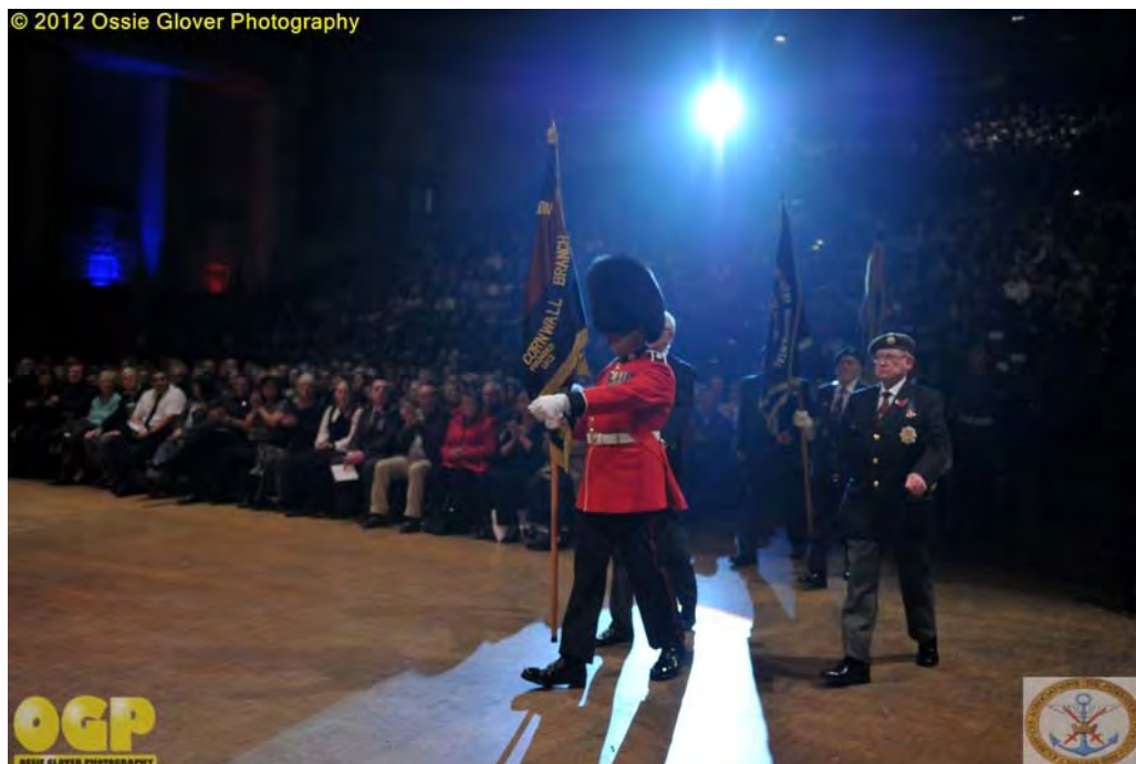
The Army Associations marching on.