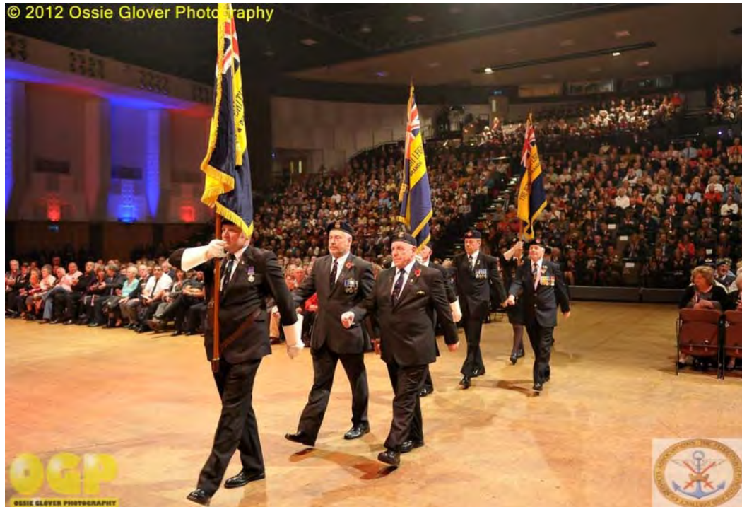
Some of the Royal British Legion Standards march on.