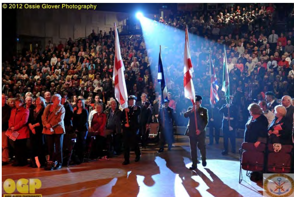
Finally the flags of the four countries of the United Kingdom precede the Union flag carried by a member of the Devon and Cornwall police.